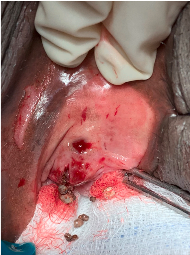
Fig. 1. Opening of the cyst with stones extraction.