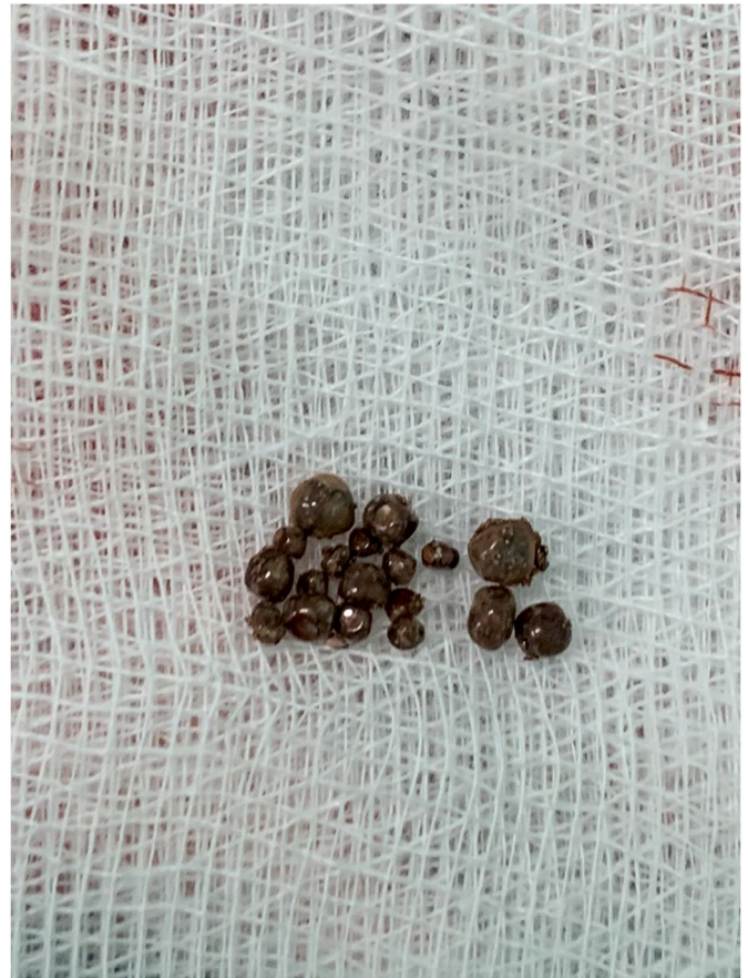
Fig. 2. The extracted stones.